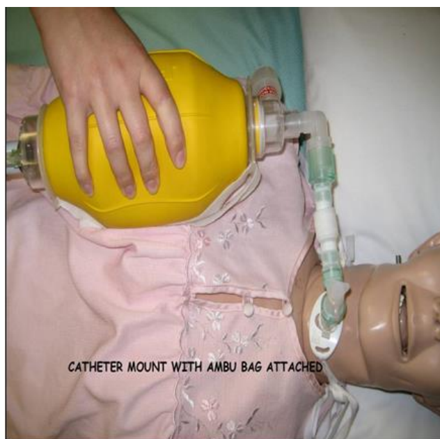
3. Catheter Mount with Ambu -Bag attached

4.5.1.10 Attach the Bag Valve Mask to 15L oxygen.