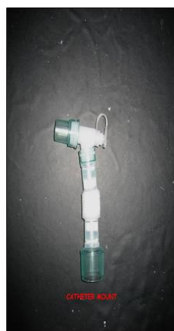
2. Catheter Mount