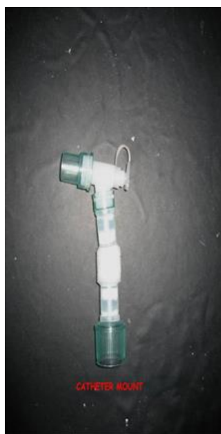
. Catheter Mount