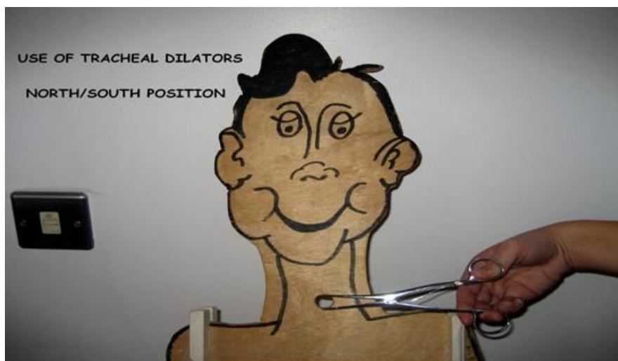
1. Use of Tracheal Dilators in a North South Position

3.7.1.5 If not, keep the stoma open using a tracheal dilator from the emergency tray, ensuring that the dilators are inserted in a north/south position