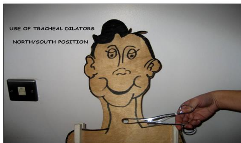
1. Use of Tracheal Dilators in a North South Position

3.6.1.10.6 The dilators must be inserted in a north/south position