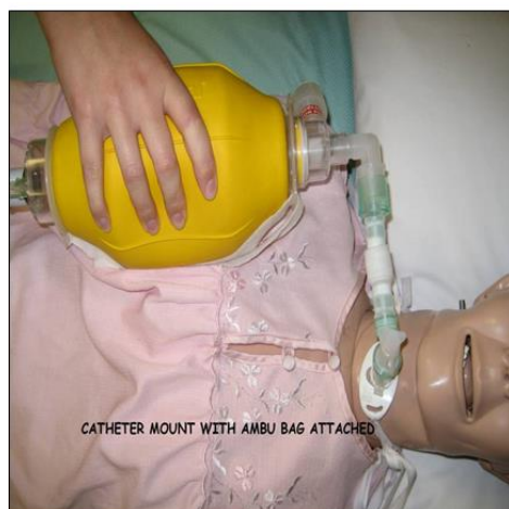
3. Catheter Mount with Ambu-Bag attached